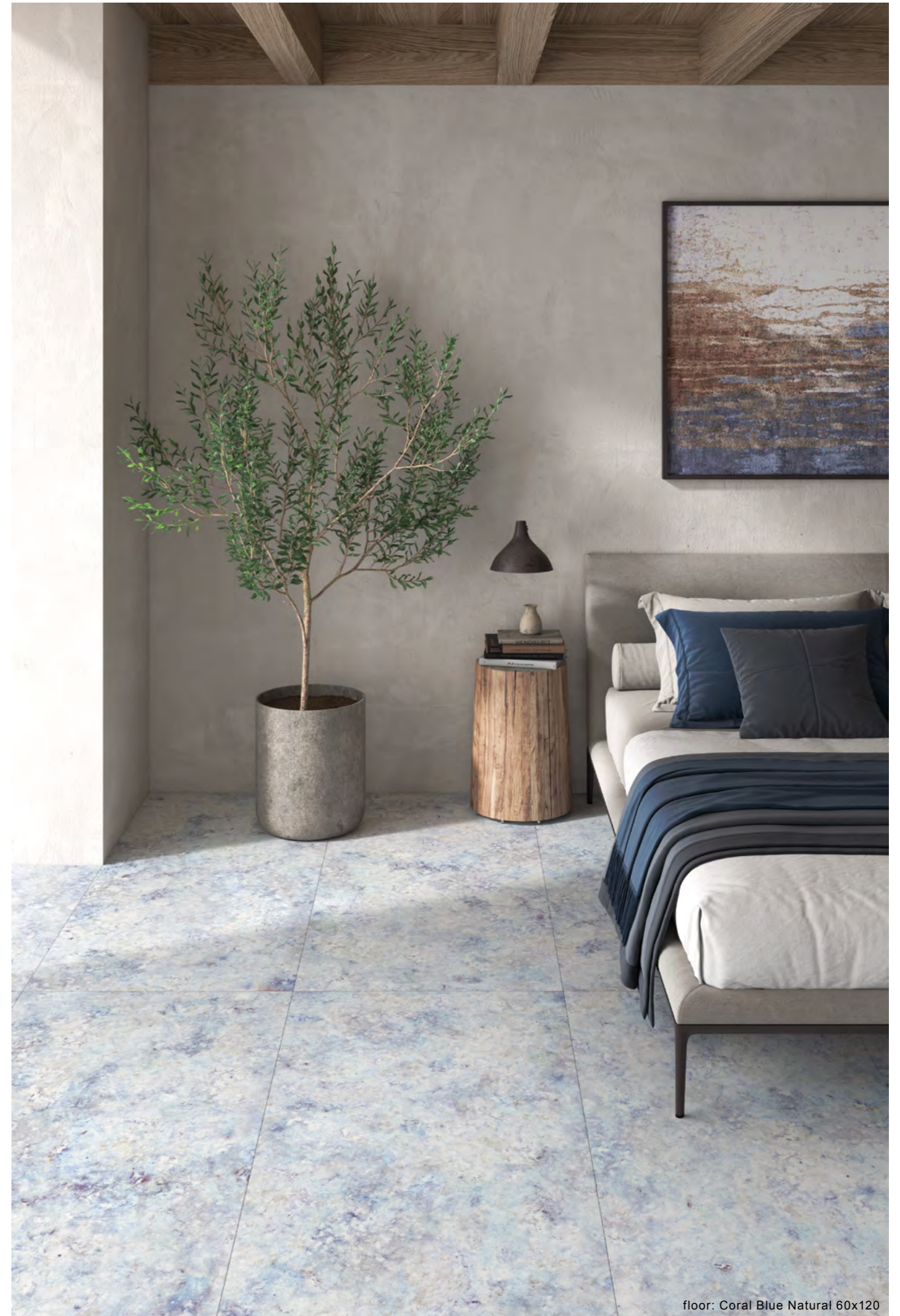
floor: Coral Blue Natural 60x120